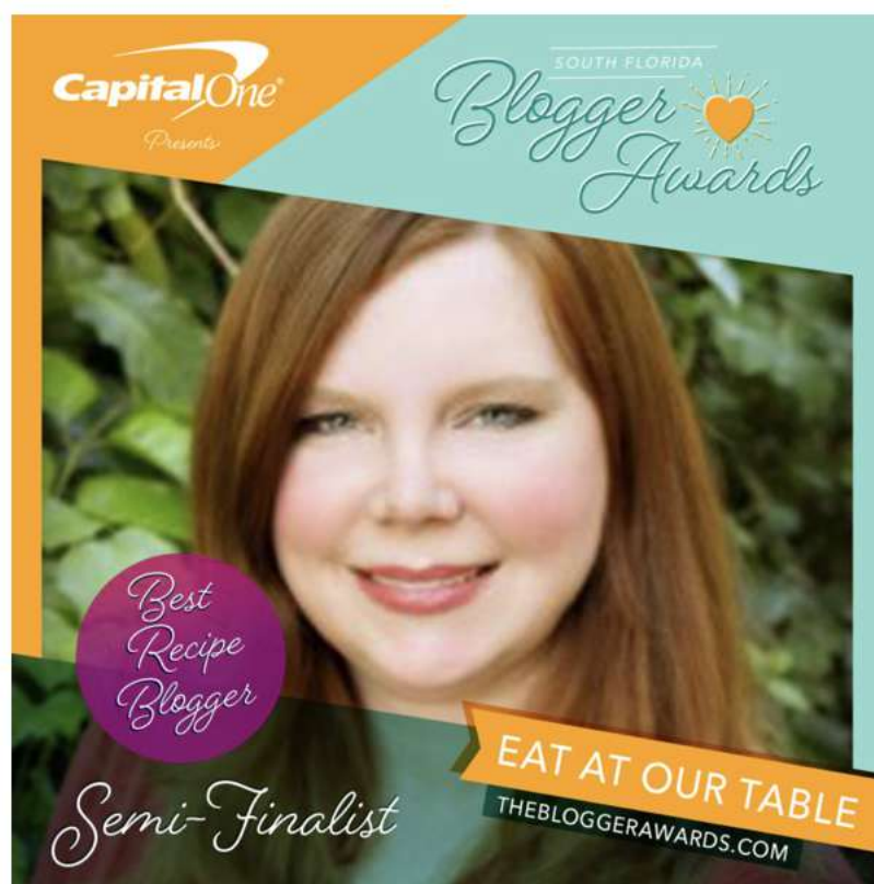
Eat at Our Table