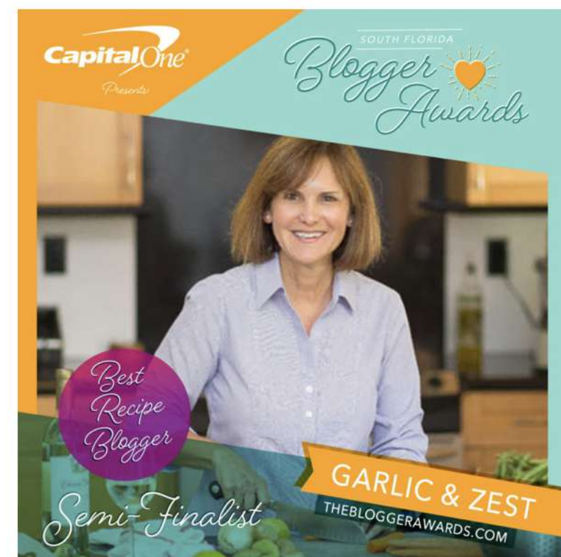
Garlic & Zest